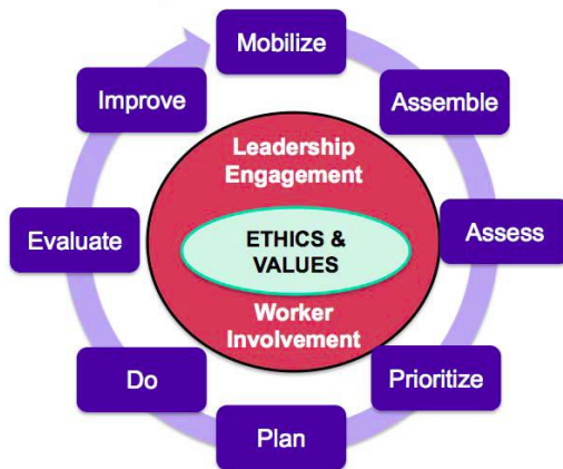
Figure 9.2 WHO Model of Healthy Workplace Continual Improvement Process

Two of the core principles are leadership engagement based on core values and ethics, and worker involvement. These are not merely steps in the process, but are ongoing circumstances that must be tapped into at every stage of the process.